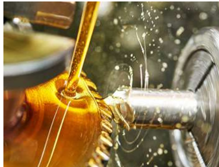
STRAIGHT CUTTING OIL