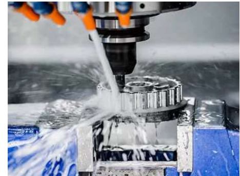
WATER SOLUBLE CUTTING OIL